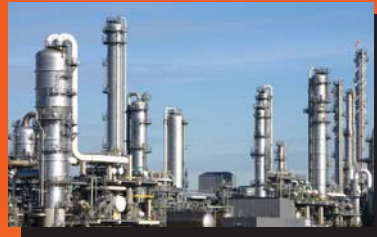
refineries and industrial facilities