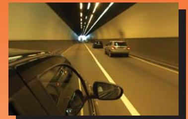
railway and road tunnels