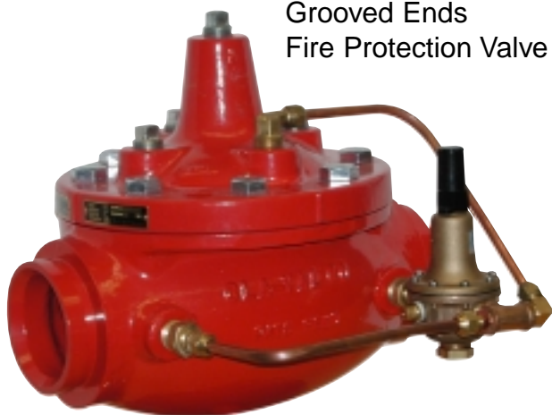
Ductile Iron, Bronze Trim Globe 1 1/2" - 6" Angle 2" - 4"