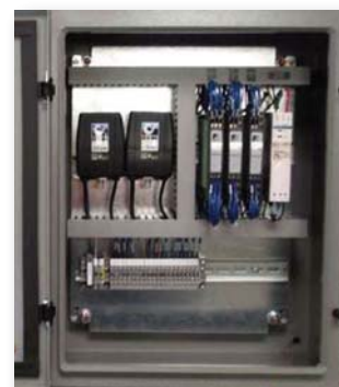
PRV Control Panel & Wiring Strip

During this timeframe, minimum night flow pressure savings has exceeded 12 psi or a 20% reduction from a system without pressure management. In addition to the leakage flow rate savings, there was a significant reduction in water main break frequency. In fact, in the time since the East York pilot program was implemented, there have been no recorded water main breaks within the PMA boundaries. Historically, that same area experiences a break frequency of 6 to 8 breaks per year, with most occurring between the months of November and March. So on the way to treat a symptom, the City of Toronto may have very well stumbled onto a cure for one of the most pervasive and expensive operational challenges a water company can face. They expect to roll out a city-wide pressure management program starting in 2009.