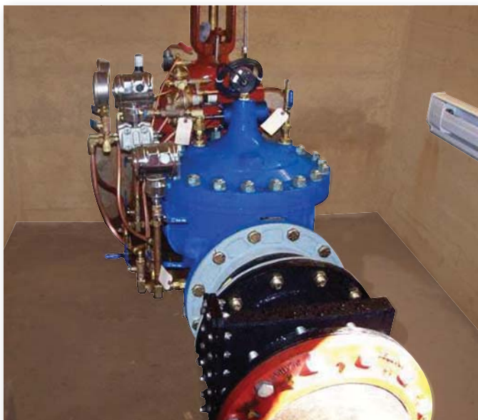
Cla-Val Flow Modulated PRV Assembly: Electronic Pressure Management Valve

When the City of Toronto went looking for ways to reduce water loss in their city's distribution system, they had no idea that the solution they selected would ultimately lead to a winter that was free of pipe breaks - but that's just what happened in their pilot test in East York.