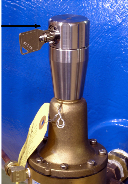
X140-1 Locking Security Cap