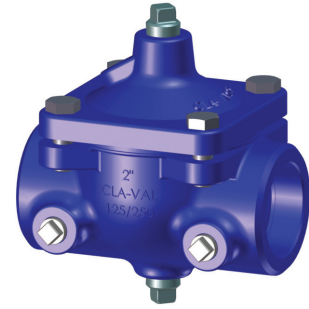
Cla-Val Model 7100 On/Off Valve