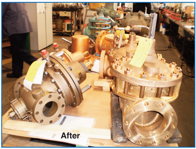
Everything you need to return your valves to active duty.