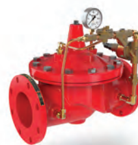
Cla-Val Automatic Control Valves