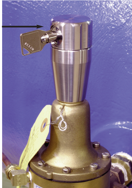
X140-1 Locking Security Cap