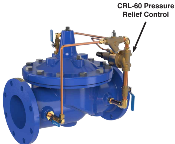
50 Series Pressure Relief Control Valve

Model CRL-60 Pressure Relief Control is ideally suited as pilot control for Cla-Val Series 50 pressure relief or pressure sustaining automatic control valves. The 50 Series valves are hydraulically operated, pilot controlled, modulating type valves, used where pressure relief is needed in a waterworks pipeline distribution system downstream of any high pressure source, such as pressure reducing stations or pump stations, or they can also be used in a bypass to control pump delivery pressure.