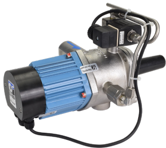
Retrofittable X143IP Power Generator