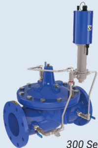
300 Series Electronic Control Valve